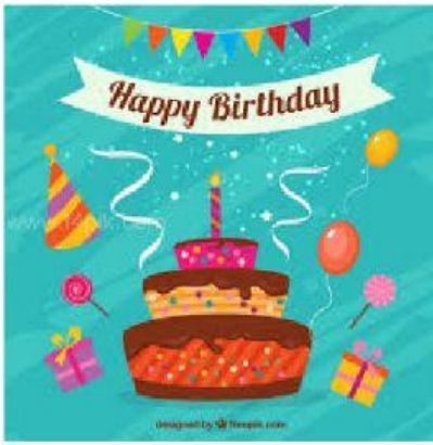
1. Birthday card