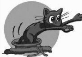
let the cat out of the bag