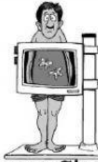
butterfiles in one's stomach