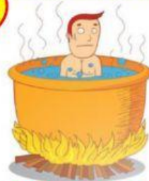
In hot water

o) I don't know how you could afford this sports car. It must have _____.