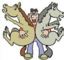
hold your horses