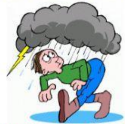
under the weather