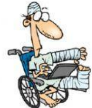
cost an arm and a leg