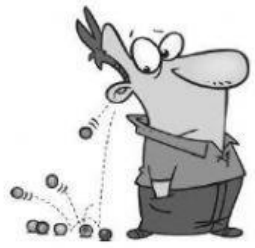
lose one's marbles