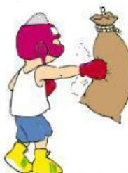
hit the sack