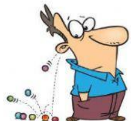
lose one's marbles