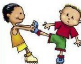
pull one's leg