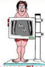
butterflies in one's stomach