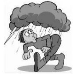
under the weather