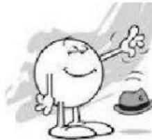
at the drop of a hat