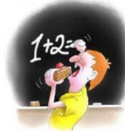
a piece of cake