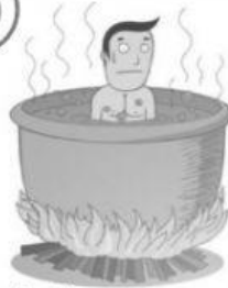
In hot water

o) I don't know how you could afford this sports car. It must have _____.