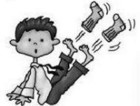
knock one's socks off