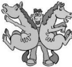
hold your horses