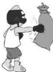
hit the sack