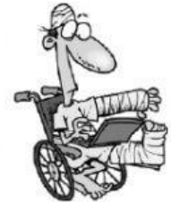
cost an arm and a leg