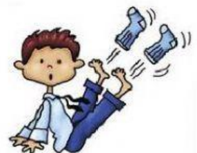
knock one's socks off