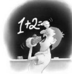
a piece of cake