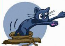
let the cat out of the bag