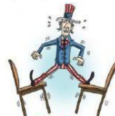
caught between two stools