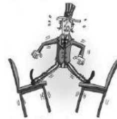
caught between two stools