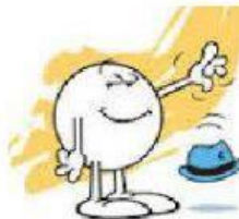
at the drop of a hat