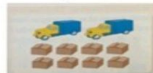
Picture B :