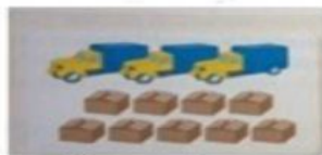
Picture A :