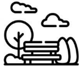
Go to the park