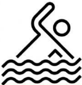
Swim in the lake