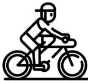
Ride my bike