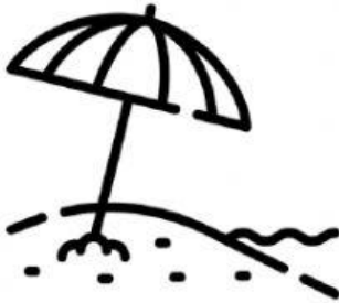
Go to the beach