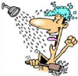
have a shower