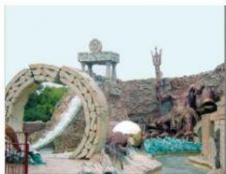
Garland Theme Park, Italy