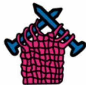
He knits a sweater.