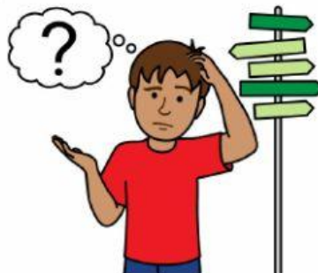
He got lost.