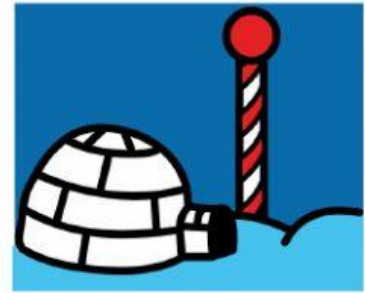
At the North Pole