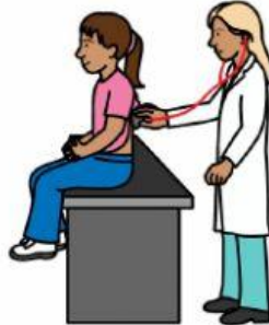
At the doctors office