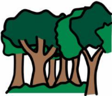
In the woods