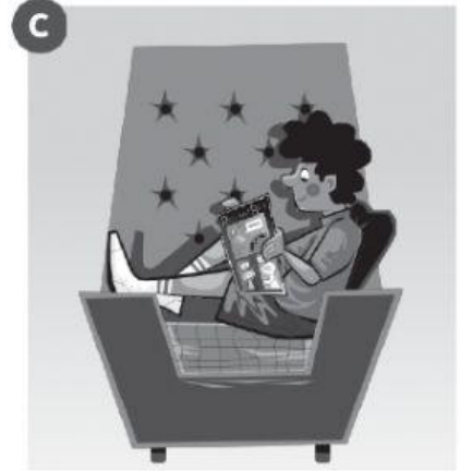
read a comic