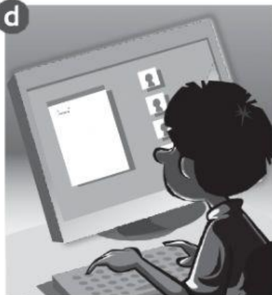
write an email