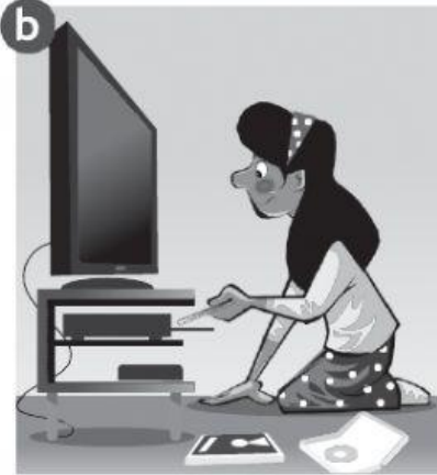
watch a DVD