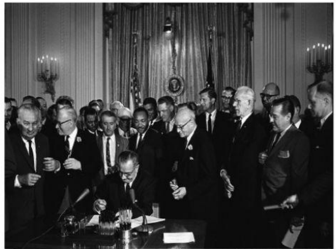
The Civil Rights Act was passed in 1964 which outlawed discrimination based on color or race.

In 1963, Martin Luther King, Jr. helped to organize the "March on Washington". Many people marched over important issues such as segregation in schools, discrimination during employment, and overall inequality. At this time, he gave his famous "I Have a Dream" speech. Thanks to his efforts, the Civil Rights Act was passed in 1964.