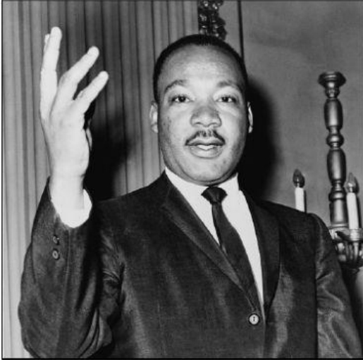
King was a social activist that led the Civil Rights Movement

DIRECTIONS: Identify the text features in the passage.