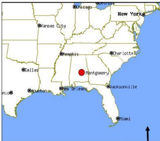
The bus boycott took place in Montgomery, Alabama