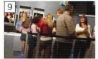
to the cinema