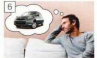
a new car