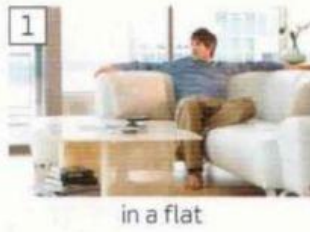
in a flat