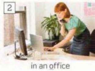
in an office