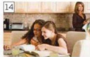
homework / housework