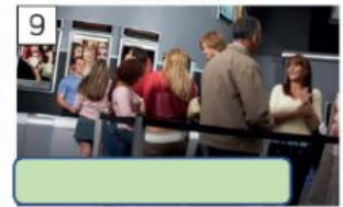
to the cinema