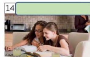
homework / housework