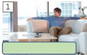
in a flat

cook /kʊk/ do /duː/ drink /drɪŋk/ eat /iːt/ go /gəʊ/ have /hæv/ like /laɪk/ listen /ˈlɪsn/ live /lɪv/ play /pleɪ/ read /riːd/ say /seɪ/ speak /spiːk/ study /ˈstʌdi/ take /teɪk/ want /wɒnt/ watch /wɒtʃ/ wear /weə/ work /wɜːk/