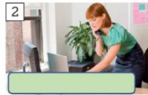
in an office