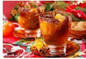
Dried fruits compote