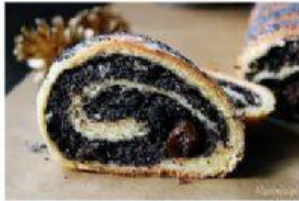
Poppy seed cake