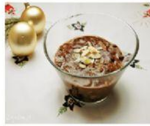
Silesian Christmas dessert soup (gingerbread and delicacies)