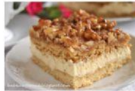
Cake with nuts