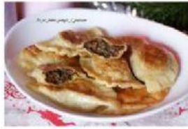
Pierogi (dumplings) with cabbage and mushrooms