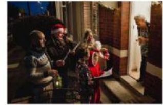
Family singing carols