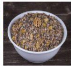
Kutia (poppy seeds,