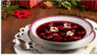
Borscht with dumplings

CLICK THE NAME OF EACH DISH UNDER THE PICTURE, LISTEN AND REPEAT.