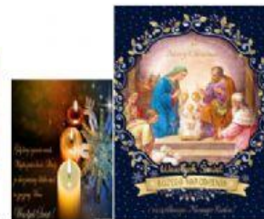
Candles Christmas Eve Shepherd Mass at midnight Empty place setting on the table for an unexpected guest