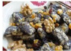
Noodles with poppy seeds