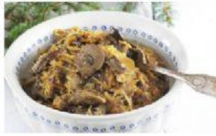
Sour cabbage and mushrooms