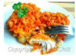
Fish and vegetables