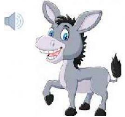
a donkey [dɒŋki]