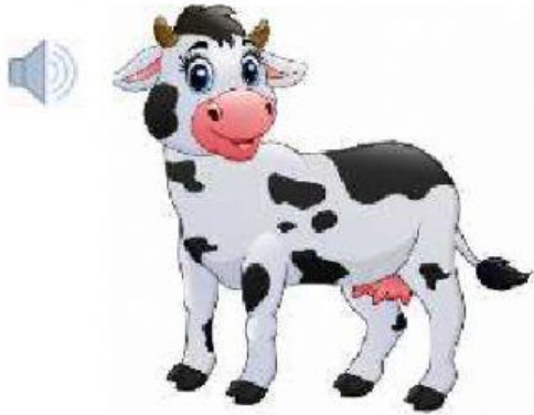
a cow [kaʊ]