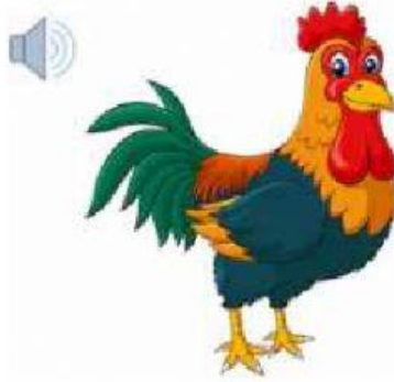
a rooster [ruːstə(r)]