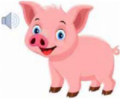
a pig [pɪɡ]