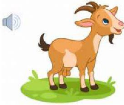
a goat [ɡəʊt]