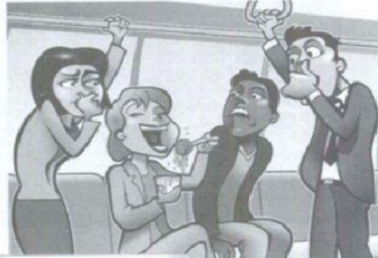
2. Eating on the subway