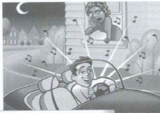
3. Playing loud music late at night