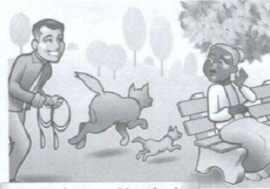
4. Letting dogs run without leashes