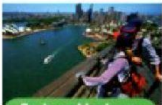
Sydney Harbour Bridge

Australia is the biggest _____ in the world. A lot of people in Australia live by the _____. They like surfing and going to the _____. Australians speak English. They sometimes call their country 'Oz'.