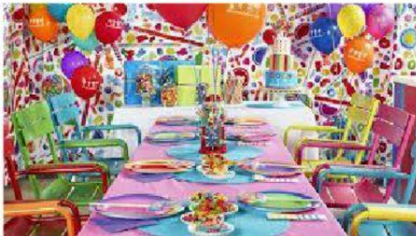
organising a party