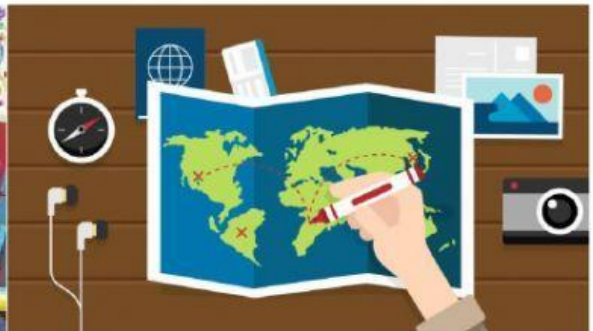
organising a trip