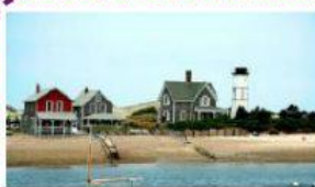
escape seafood attractions