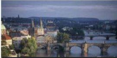
urban Spires at nightfall