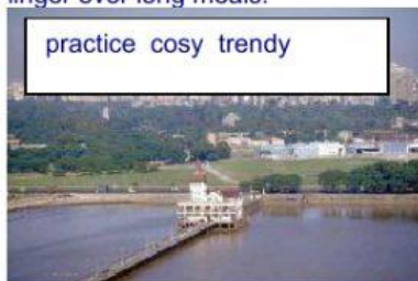
practice cosy trendy

As the old saying goes, it takes two to tango — and there's no better place to .....your moves with your partner than Buenos Aires. When you need to rest your feet, this Paris of South America has a lot more to tempt visiting lovebirds, from elegant turn-of-the-century mansions and tree-lined boulevards reminiscent of European cities like Paris, Rome, and Barcelona, to ..... bistros in .....neighbourhoods where diners linger over long meals.