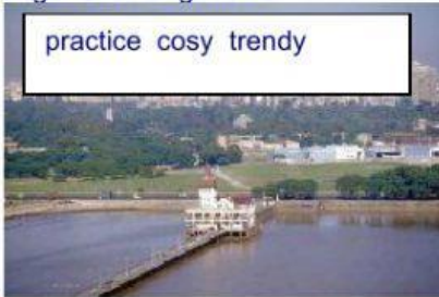
practice cosy trendy

As the old saying goes, it takes two to tango — and there's no better place to .....your moves with your partner than Buenos Aires. When you need to rest your feet, this Paris of South America has a lot more to tempt visiting lovebirds, from elegant turn-of-the-century mansions and tree-lined boulevards reminiscent of European cities like Paris, Rome, and Barcelona, to ..... bistros in .....neighbourhoods where diners linger over long meals.