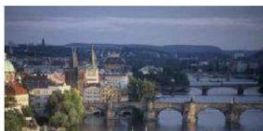
urban Spires at nightfall