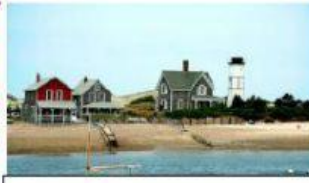
escape seafood attractions