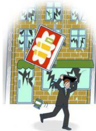
To move away