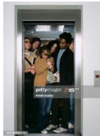
To get into an elevator