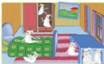
There's a ghost on the bed.