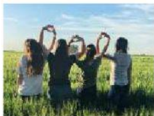
My Friends are wearing jeans

Instructions: Choose the personal pronoun that substitutes the blue section on each example.