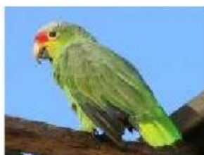
Lorenzo is green