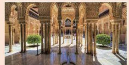
La Alhambra (Granada)