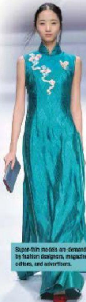
Super-thin models are demanded by fashion designers, magazine editors, and advertisers.