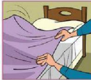
make your bed?