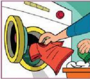
wash your clothes?