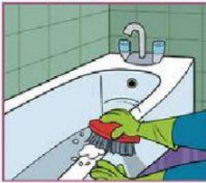
clean the bath?