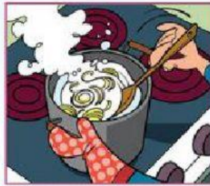
cook the dinner?