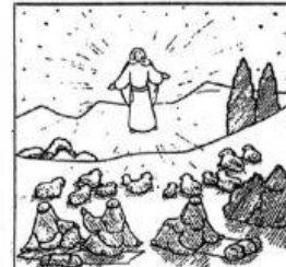
7. On the hillside, an angel appeared to the shepherds.