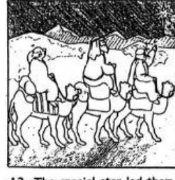
13. The special star led them to the baby king.