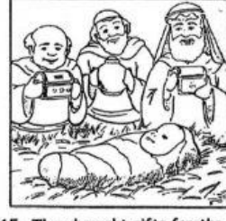
15. They brought gifts for the new-born king. They gave him gold, frankincense and myrrh. This was the first Christmas.