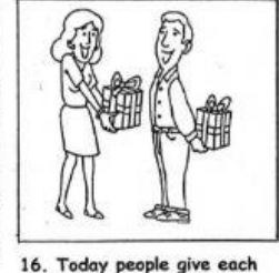
16. Today people give each other gifts on Christmas. They remember the gifts that the wise men gave to the baby Jesus.