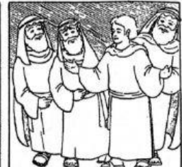
8. The angel told the shepherds the good news.