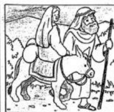
4. Mary and Joseph went to Bethlehem. It was a long trip.