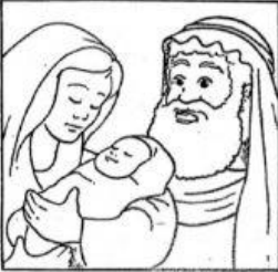
11. Mary and Joseph named the baby 'Jesus'.