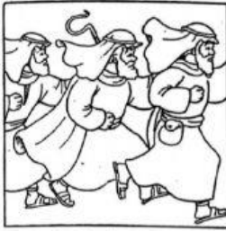
9. The shepherds went to Bethlehem.