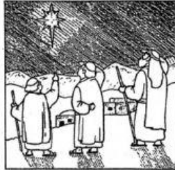
12. Later, wise men saw a special star in the east.