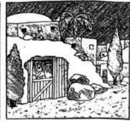
6. At last they found a shelter, and the baby was born.