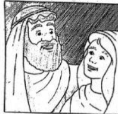
3. Joseph shared the secret.