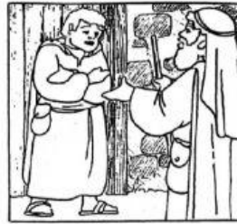
5. When they got to Bethlehem, there was nowhere for them to stay.