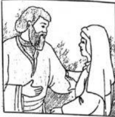
1. Two thousand years ago, the angel Gabriel visited Mary.