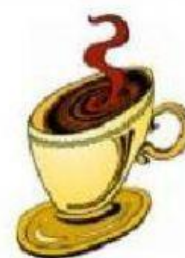
my cup of tea