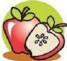
the apple of one's eye

I got a dent in my dad's car, so I'll .....before I tell him about it.