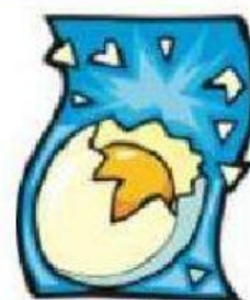
a bad egg

bread and butter a bun in the oven takes the cake a hard nut to crack bad egg as cool as a cucumber a piece of cake out to lunch a big cheese cup of tea the apple of my eye spill the beans a couch potato a grain of salt one smart cookie butter him up