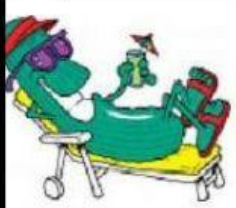
as cool as a cucumber