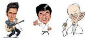
famous person ↑

Elvis is a _____ person, but he isn't as _____ as Jackie Chan and the Pope. Jackie Chan is _____ than Elvis and _____ than the Pope. The Pope is known everywhere, so he is _____ in the world.