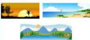
gorgeous landscape ↓

Beast is _____, but not as _____ as Wolverine and Cyclops. Wolverine is _____ than Beast and _____ than Cyclops. Cyclops is _____ of all three X-men.