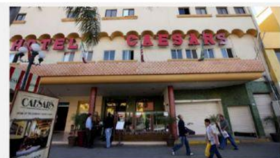
Caesar's Restaurant in Tijuana is the original home of the legendary salad

In fact, the salad soon 10) _____ (become) popular all over the world. In the 1940s, Gourmet Magazine 11) _____ (call) the dish 'the gastronomic highlight of the current moment'. And in 1953, it was even crowned as the greatest recipe of America.