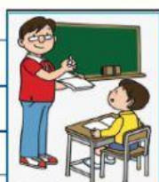
He is a teacher

3. What do they do? Complete the sentences according to the pictures.