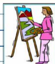
She is a painter