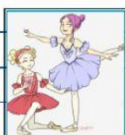
They are dancers