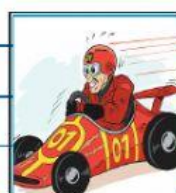
He is a driver