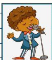
He is a singer