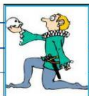
He is an actor