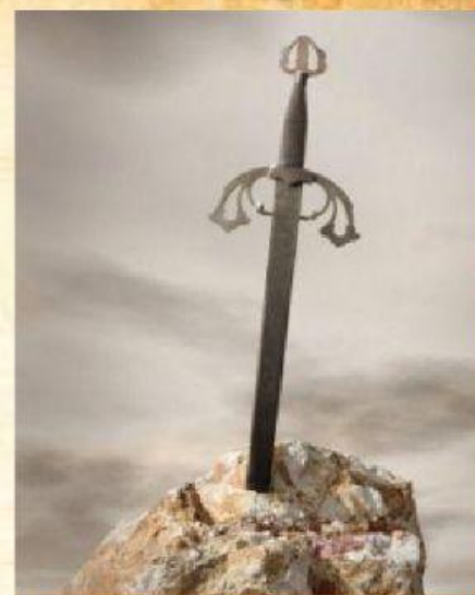
Excalibur King Arthur's sword