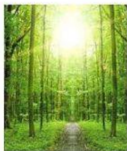
1 forest / city