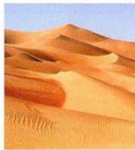
3 desert / waterfall