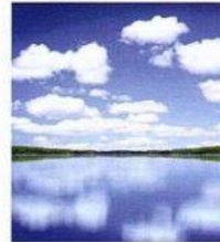
5 lake / beach