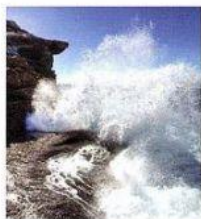
0 sea / river