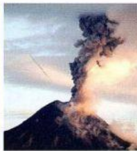
2 volcano / island