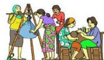
POSYANDU SAHABAT KELUARGA

Posyandu is the place for the infant and the toddler to get health services. For example they will get injection or immunization, they will get the nutriment. Posyandu is done by the women in the village by gotong royong.