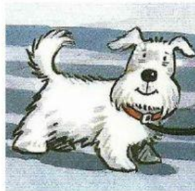
IT is a dog.