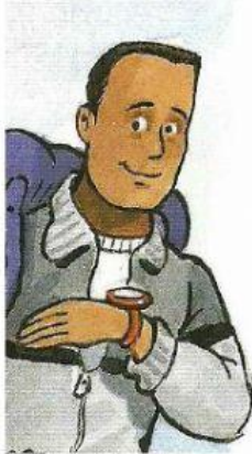
HE is a man.