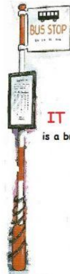
IT is a bus stop.