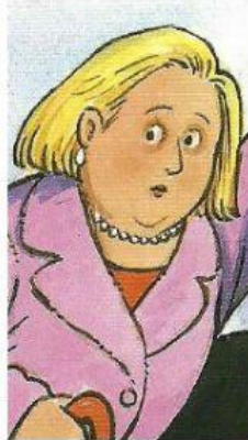
SHE is a woman.