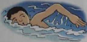
10 go swimming