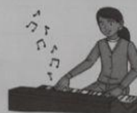
10 the _____