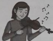
6 the _____