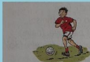
1 play football