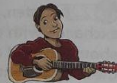
6 play the guitar