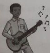
3 the _____