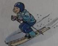
9 go skiing