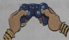
4 play computer games