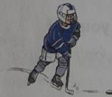
3 play ice hockey