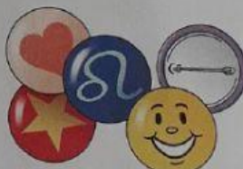
8 collect badges