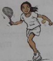
2 play tennis