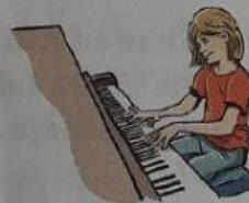
5 play the piano