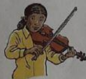
7 play the violin