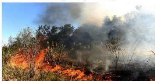
Fires burn in the Paraná Delta, Argentina.

Argentina's Paraná Delta is also on fire, threatening a vital ecosystem that is home to hundreds of species of plants and animals and helps regulate the climate. Like Brazil, these fires are mainly caused by farmers clearing the land for agriculture. However, the fires have been made worse by the strongest drought in 70 years and lack of rainfall. Fires are also now raging in Argentina's Córdoba province, threatening homes and forcing evacuations. These are also intentional fires, based on the economic interests of the agricultural and real estate sectors. Coupled with the droughts, they are causing irreversible destruction.