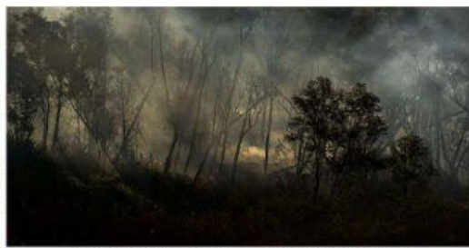
Fires burn in the Paraná Delta, Argentina.