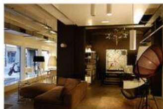
Business firm (háng)