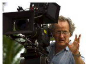
(dǎo yǎn) director