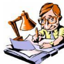
(zuò jiā) writer