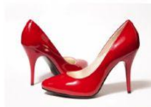
(gāo gēn xié ) high-heeled shoes