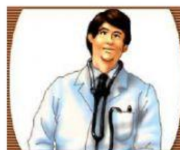
(yīshēng) doctor; physician