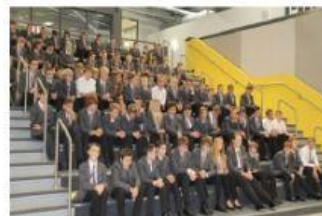
middle school student ( zhōng xué shēng )