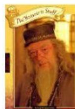
headmaster, principal, ( xiào zhǎng )