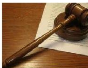
law firm (lǚ shī háng)