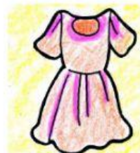
dress (lián yī qún)