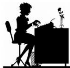
( mì shū ) secretary