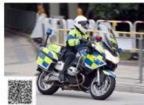
( jǐng chá ) policeman