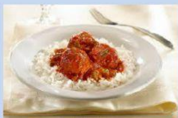
RICE AND MEATBALLS

WHAT CAN THEY ALL EAT? THINK OF THE FOOD THEY LIKE AND DON'T LIKE AND DECIDE THE BEST MENU FOR GRANDMA AND GRANDPA TO COOK.