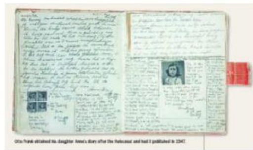
Otto Frank obtained his daughter Anne's diary after the Holocaust and had it published in 1947