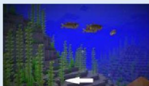
#6. kelp plants