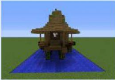
#7. witch's hut