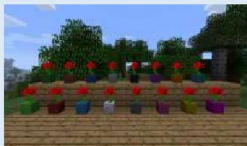
#2. flower pots