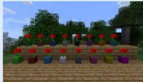
#2. flower pots