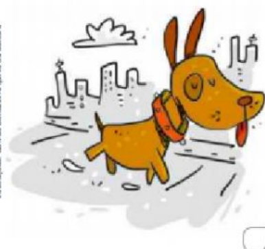
Illustration: David Benoit/Alamy

wander /'wa:ndə/ verb to walk slowly about a place without any purpose or direction: They wandered around the streets. • vagar