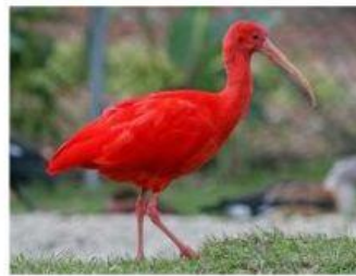
The Scarlet Ibis

3. Select the Coat of Arms of Trinidad and Tobago.