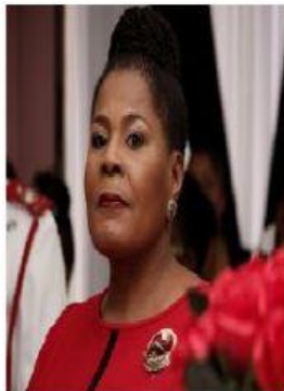
Her Excellency Paula-Mae Weekes

5. Who is the present Prime Minister of Trinidad and Tobago?