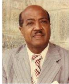
Sir Ellis Clarke