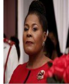
Her excellency Paula-Mae Weekes

5. Who is the present Prime Minister of Trinidad and Tobago?