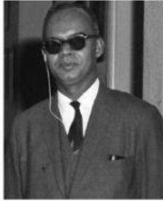
Dr. Eric Williams

4. Who was the first President of Trinidad and Tobago?