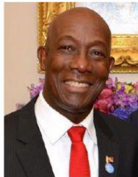
Dr. Keith Rowley