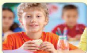
I am eating lunch now.