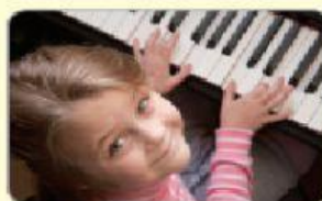
She is playing the piano.