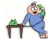
Call my friends.