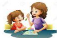
Eat with my grandmother.