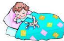
Sleep with my cousin.