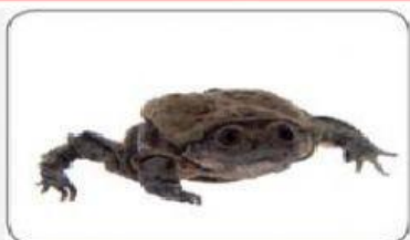
Titicaca water frog

1. LOOK at the pictures and ANSWER the following question.