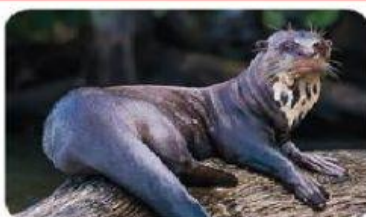
Giant river otter