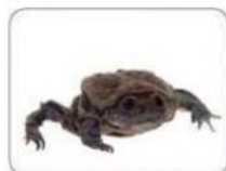
Titicaca water frog

Look at the pictures and answer the following question: