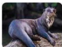
Giant river otter