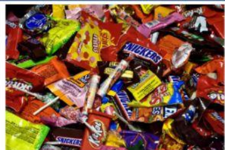
The right free candy