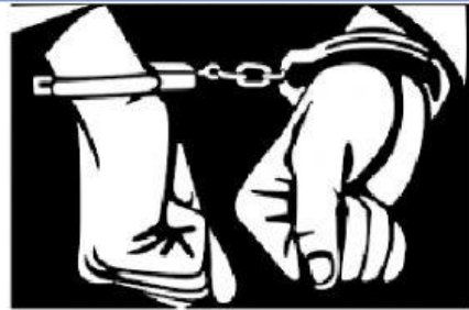
The right to break the law