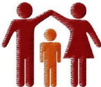
The right to be protected