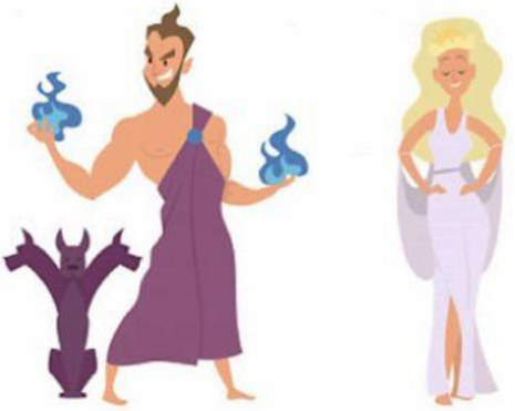
GOD AND GODDESS