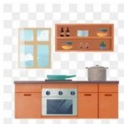
1-BEDROOM / KITCHEN

A - VOCABULARY: LOOK, READ AND CHOOSE (30 MARKS)