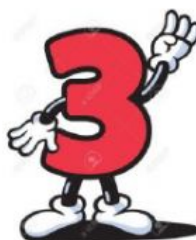
7-TEN / THREE