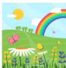
11-WINTER / SPRING