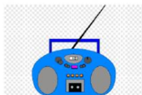
14- BED / RADIO