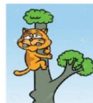
8- JUMP / CLIMB