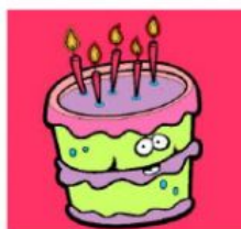
3-CAKE / PIZZA