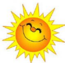
9- SUNNY / COLD