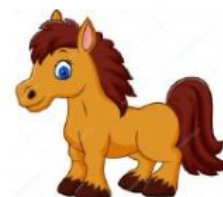
4- CAT / HORSE