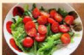
Tomato and lettuce salad