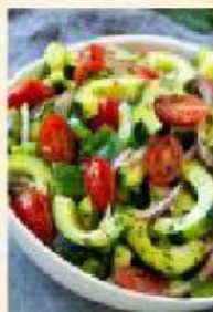
Tomato and cucumber salad