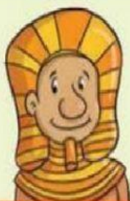
THE ANCIENT EGYPTIANS