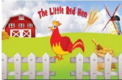
The little Red Hen

1. What was the title or name of the story?